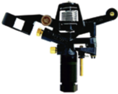
FM 3/4" (available on indent)